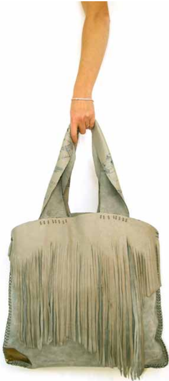
TERRA DI MEZZO